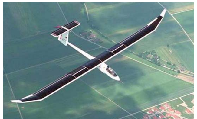
Figure 6 ICARE 2 at a cross country flight.