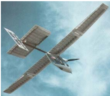
Figure 3 SOLAR CHALLENGER at its maiden flight in 1980.