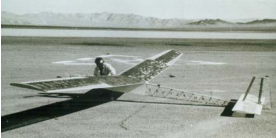
Figure 1 The first solar powered model aircraft SUNRISE 1 at Camp Irwin, California, 1974.

20 Ross, H., „Fly around the World with a Solar Powered Airplane”, Technical Soaring , this issue.