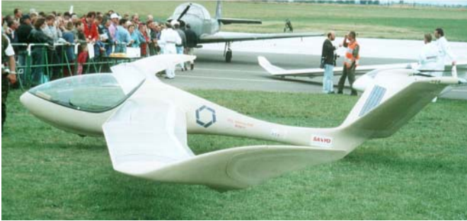
Figure 7 SOLAIR II at airfield Laupheim, Germany in July 1996.