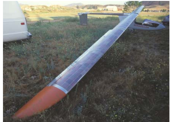
Figure 5 SUNSEEKER in September 1993.