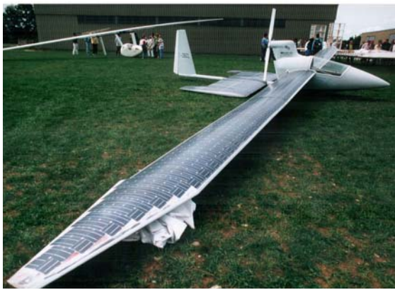
Figure 8 Solar aircraft O SOLE MIO with human powered aircraft VELAIR from Peer Frank behind at airfield Laupheim.