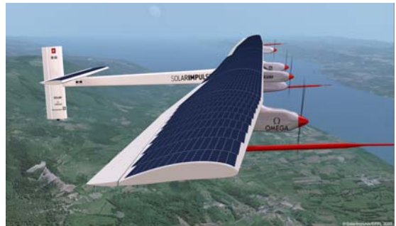
Figure 11 SOLAR-IMPULSE in flight.