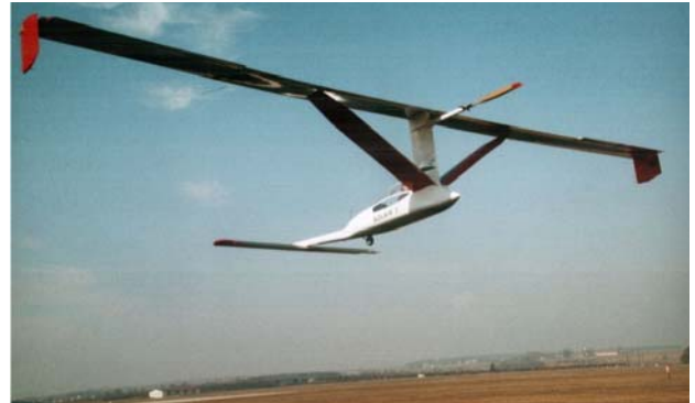
Figure 4 SOLAIR I at a test flight in spring 1981.