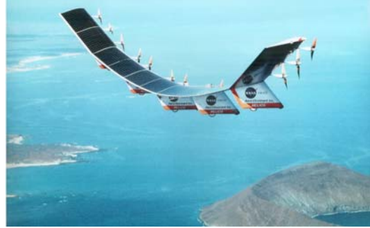
Figure 10 HELIOS near the Navy airfield Kanai, Hawaii.